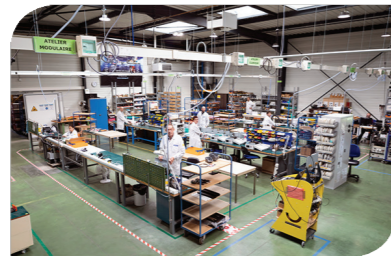
• Assembly workshop