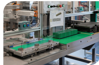
• Latest generation battery manufacturing line