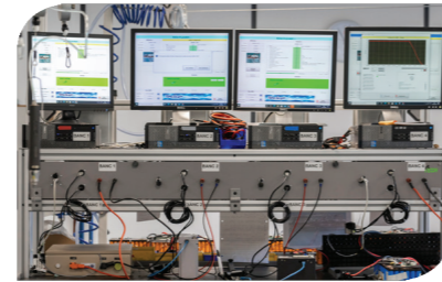
• Test benches